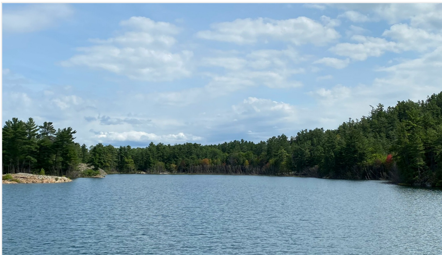
Looking east into the anchorage at Usual Reason Cove.

Maintaining the 080° course, continue on to island 1741. Here you can continue straight on into the anchorage at Papa's Cove or you can turn right (south) to the anchorage at Usual Reason Cove, or you can turn left to head northerly to Crooked Arc Cove (NC-88.5) and the East-West Channel Anchorage (NC-89) through the passage that opens up.