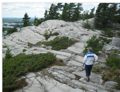
1) Looking west towards the entrance of Usual Reason Cove. 2) Some of the rugged rocks on the climb to the peak just west of Usual Reason Cove.