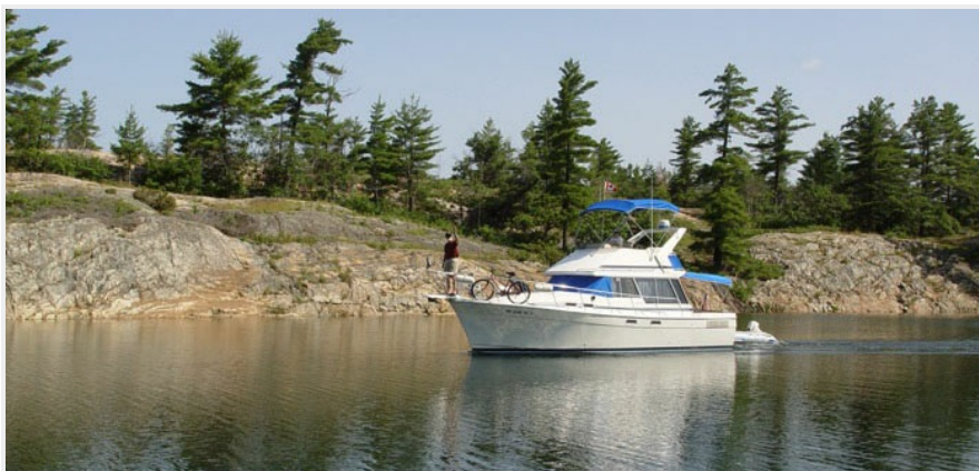
1) Anchorage at Usual Reason, just off island 1763. 2) The Usual Reason anchorage, at the very east end.