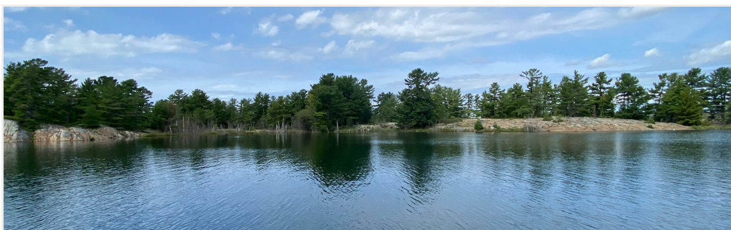
Anchorage area on the island marked as 1763.