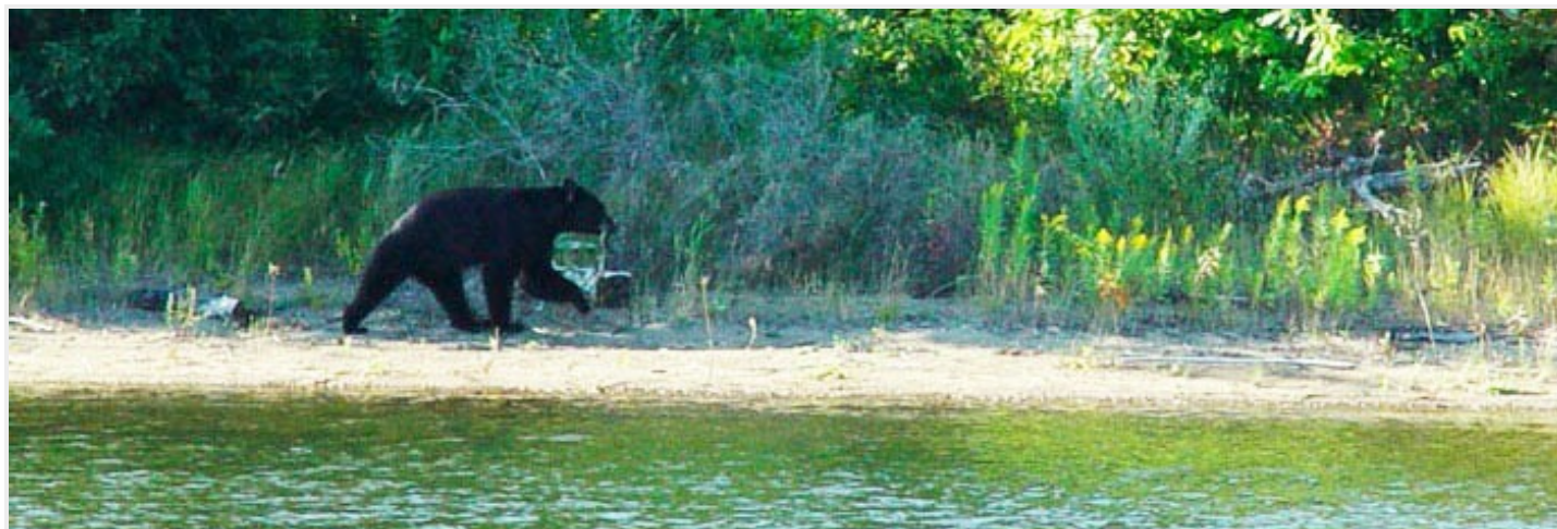
Black bear strolling the shore at Bear's Bottom, photo by Ron Dwelle.