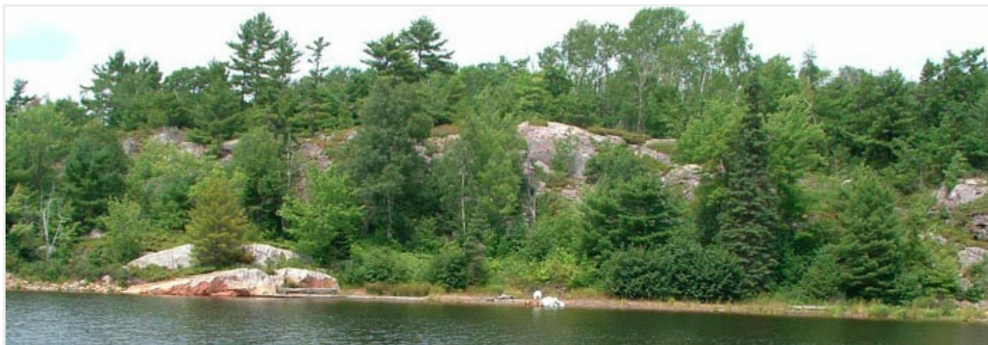
Sandy beach at Bear's Bottom Bay.

Report by Venetia Moorhouse and Susan Durchslag