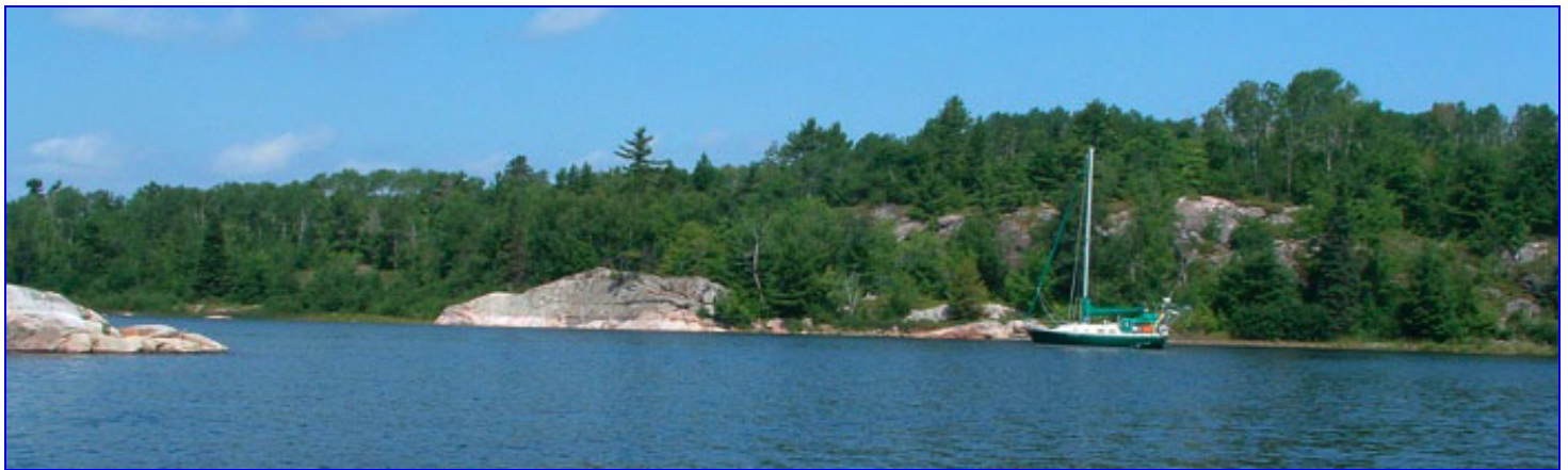
Looking northwest over the bay. The point on the left is the south edge of the bay.