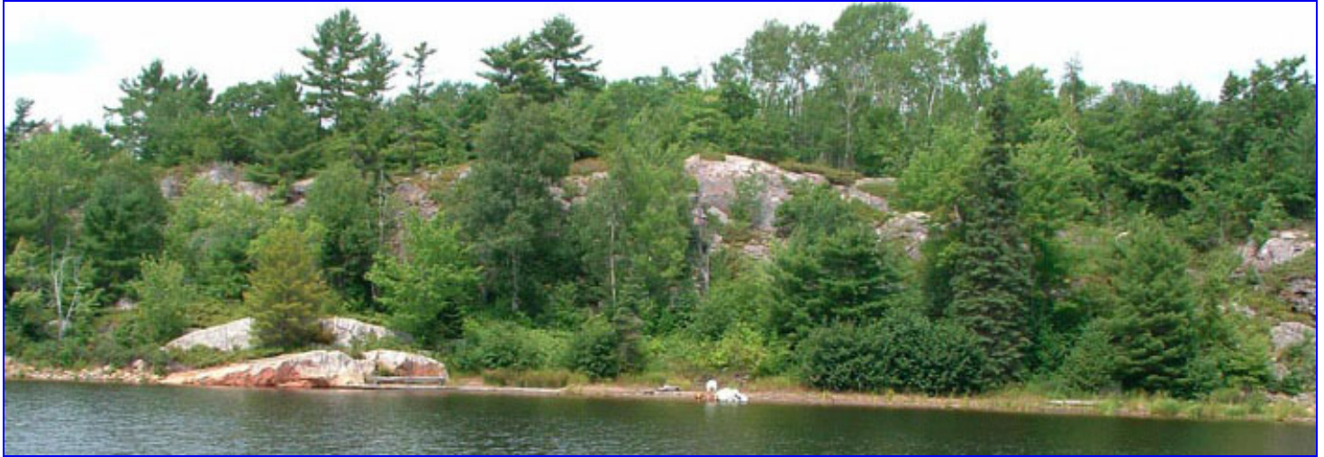
Sandy beach at Bear's Bottom Bay.

The cove gradually shallows from 13-14' at the entrance to 5-6' in the northwest corner. Anchor in 8-10' in the middle of the cove. There's room for 2 or 3 boats to swing. Note that there are some rocks along the south shore, just off the reeds. Bottom is clay.