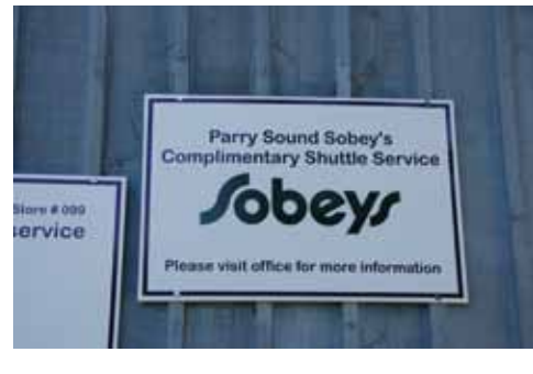
The grocery store, Sobeys, will pick you up and drop you off at the Marina.

For those wanting fresh produce before they head out after the Rendezvous, there is a Farmers' Market on Tuesday mornings just up the street from the town dock.