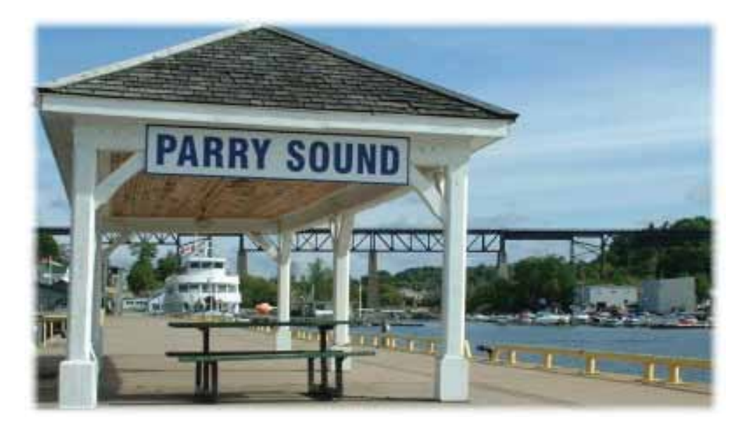
The railway bridge over the Seguin and in front of the lookout tower is a special feature of the Parry Sound waterfront.

Your Rendezvous registration includes unlimited admission to the Museum and the Tower. With changing light and weather conditions, you may want to climb the Tower more than once!