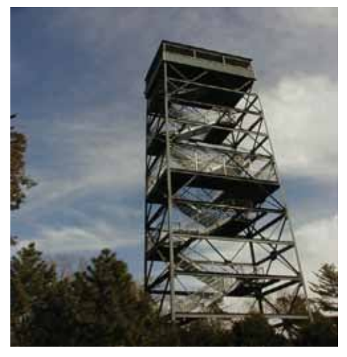
The Lookout Tower offers a panorama of Parry Sound.

In 1857, the modern townsite was established near the Ojibwa village of Wasauksing ("shining shore") at the mouth of the Seguin River. The Seguin is the river that empties into Georgian Bay at the town dock. In the late 19th century, rail service was established, making the town an important depot along the rail lines to Western Canada. A dominating feature of Parry Sound is the railroad bridge spanning the Seguin River. The subject of countless photographs and paintings, it is a special feature of this waterfront, as is the Swing Bridge in Little Current. You will