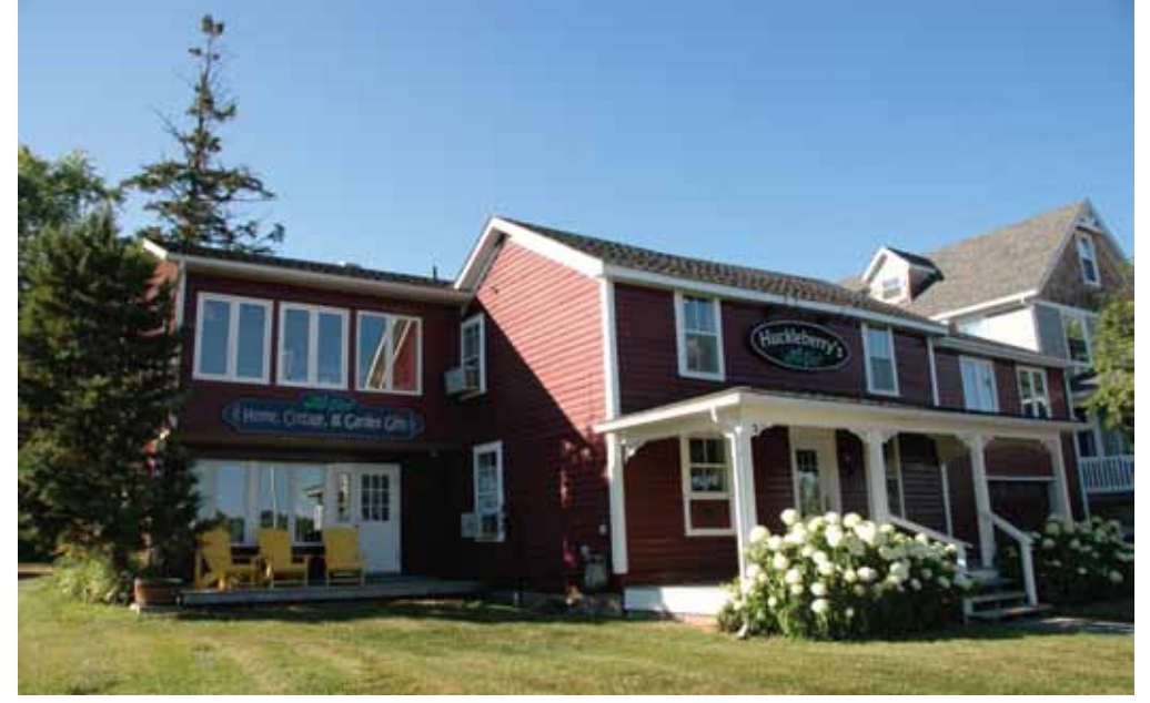
Huckleberry's Gift Shop is located next door to the Marina with lots of special products.