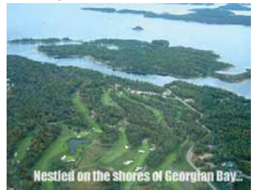
The Parry Sound Golf and Country Club north of town.

The Ridge At Manitou is an 18-hole public golf course overlooking Manitouwabing Lake, just east of town. Comprised of rock outcroppings, forests, meadows, wetland and wildlife, the course is tough but very rewarding.