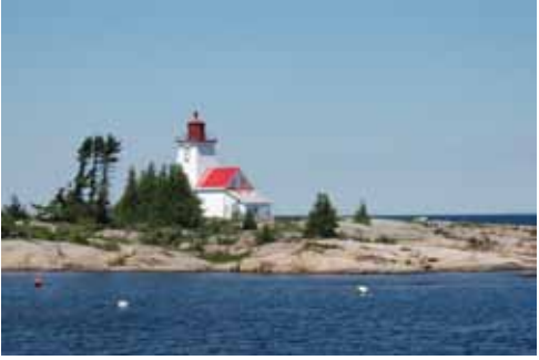
South from Killarney you pass the Byng Inlet light.

Just out of town is the highly recommended Log Cabin Inn. In addition to luxury accommodation, this Inn has an excellent fine dining restaurant. For reservations call them at 705-746-7122.