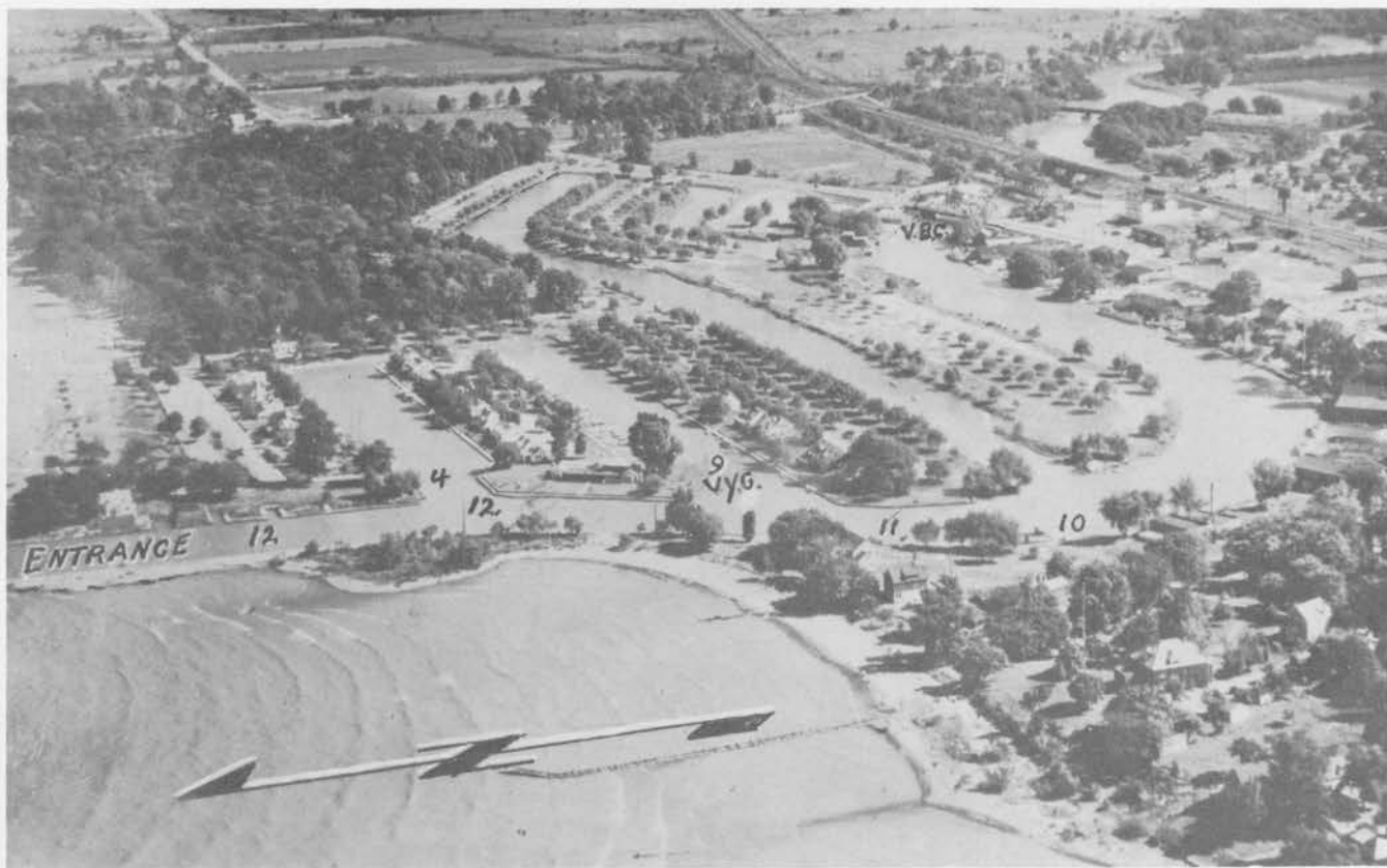
VERMILLION HARBOR, OHIO.

Ry. - New York Central and Nickel Plate.